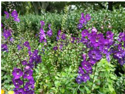
Cleome x 'Clio Magenta'