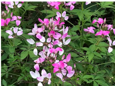
Cleome x 'Clio Magenta'