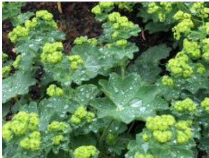
Alchemilla mollis 'Auslese'