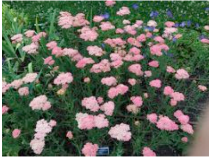
Achillea millefolium 'Appleblossom'