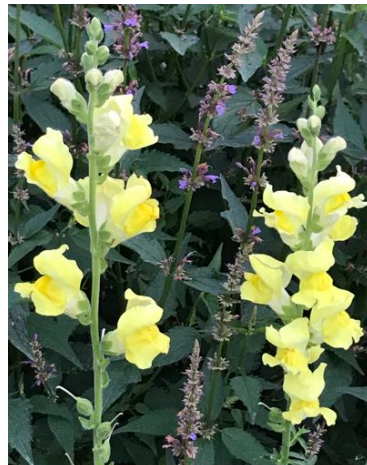
Antirrhinum majus 'Golden Rocket'