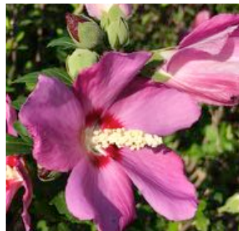
Rose of Sharon 'Aphrodite'