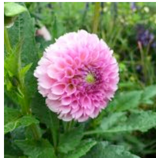
Dahlia 'Stolz von Berlin'