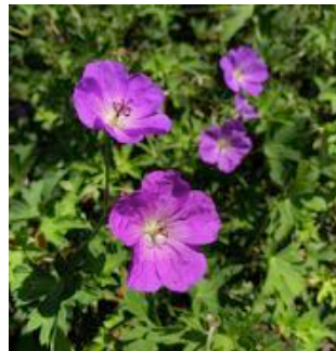
Geranium 'Rozanne'