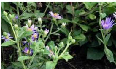
Aster macrophyllus 'Twilight' (DR)