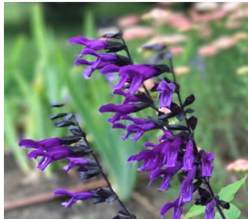
Salvia farinacea 'Victoria' short, front of border